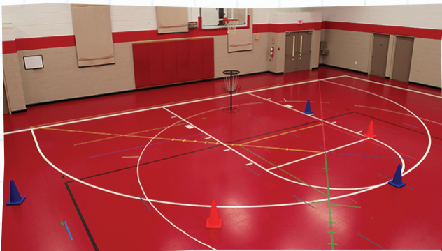
GAME SETUP A.