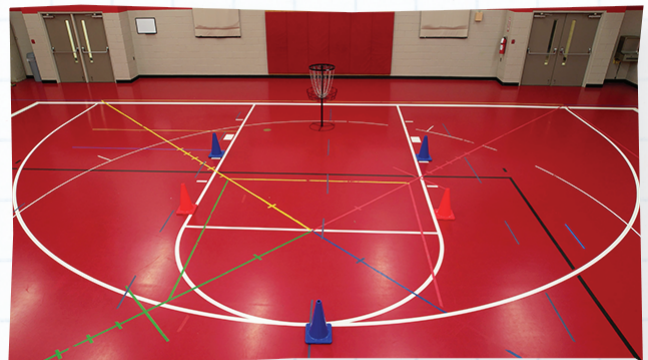
GAME SETUP B.